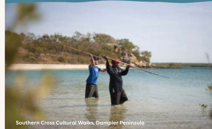
Southern Cross Cultural Walks, Dampier Peninsula

The Dampier Peninsula, in Western Australia's Kimberley region, is a unique location with significant environmental, cultural and heritage values.