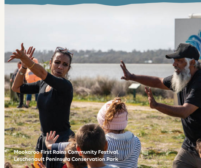
Mookaroo First Rains Community Festival, Leschenault Peninsula Conservation Park

Western Australia has a wealth of national parks and conservation reserves which, by their very nature, provide a fitting setting for authentic and memorable Aboriginal cultural tourism experiences.