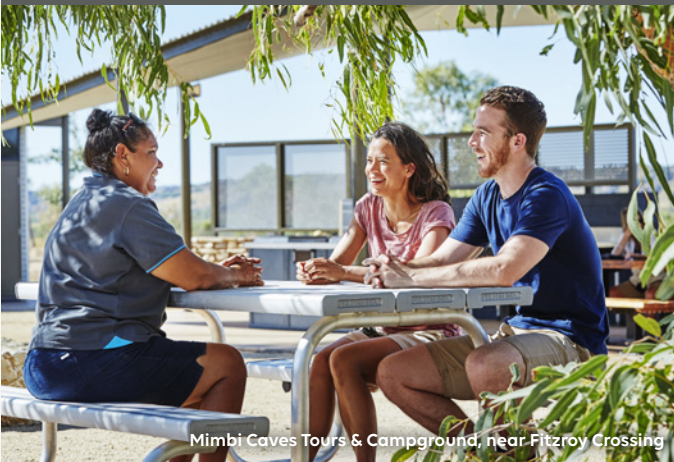
Mimbi Caves Tours & Campground, near Fitzroy Crossing

Camping with Custodians sites are supported by Tourism WA through the pre-planning, approvals, land assembly and construction stages, with the host communities provided with ongoing training, capacity building, business development and marketing support. There are currently five operational Camping with Custodians campgrounds across the north west, with plans for three more to be included in the network over the next couple of years.