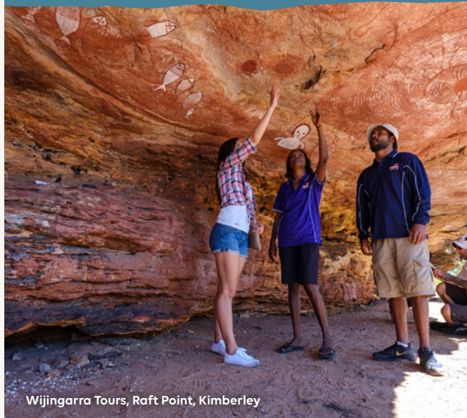
Wijingarra Tours, Raft Point, Kimberley

One of the fastest growing tourism sectors in Western Australia is cruising and an Aboriginal tourism venture in the Kimberley is getting aboard.