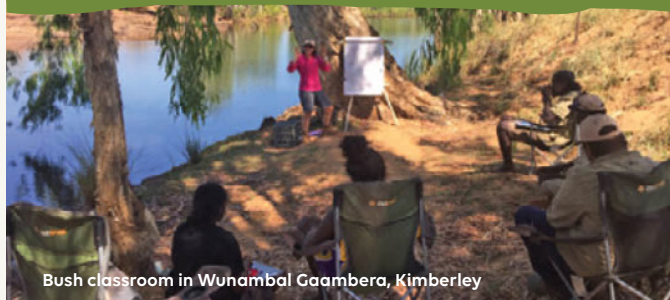
Bush classroom in Wunambal Gaambara, Kimberley

A classroom in the bush is creating a win, win, win situation in Wunambal Gaambara Country in WA's north.