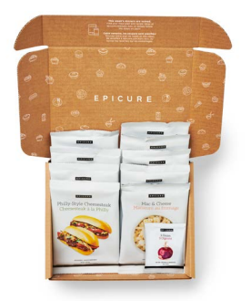
Different selections delivered every month, right to your door.