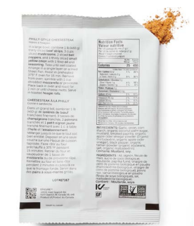
Choose from on-pack directions or use the QR code to find bonus recipes online.