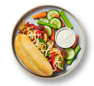
Go from raw-to-ready in 20 minutes or less.