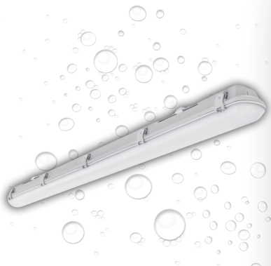
RAB 4FT VAPOURPROOF 35W 4K DIM

POST A PICTURE OF YOUR RAB INSTALL ON SOCIAL MEDIA AND #RABDESIGN TO RECEIVE A FREE SWAG BAG*