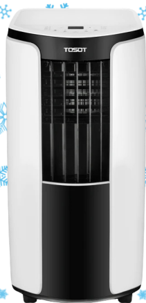
8000BTU PORTABLE A/C $372.68