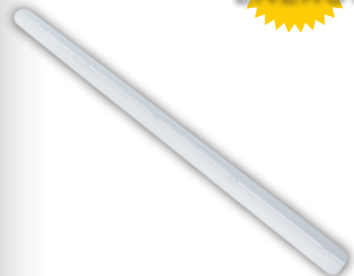
RAB 8FT STRIP LIGHT 64W CCT DIM 120-347V