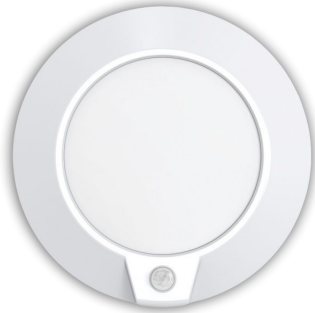
RAB SPACELITE PRO 12W 4K OCC SENSOR