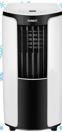
10000BTU PORTABLE A/C $404.57