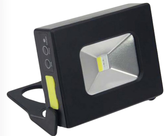
STANDARD 10W LED BATTERY FLOOD