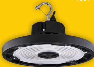
RAB Highbay 150W 4K/5K 120-347V DIM WET