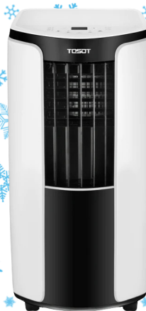
12000BTU PORTABLE A/C $543.99