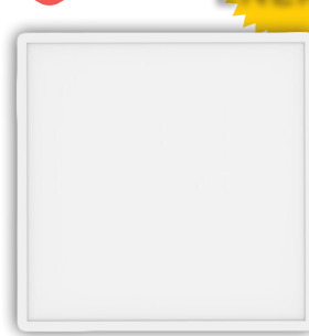
2X2 FLAT PANEL 40W 4K DIM 120-347V