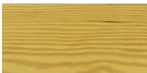
Honey Gold 57502A