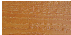
Honey Gold MV200E2099