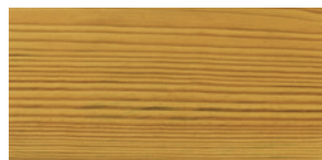
Cedar Naturaltone 57503A