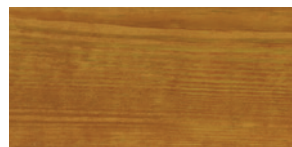
Redwood Naturaltone 57504A