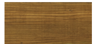
Canyon Brown 57505A