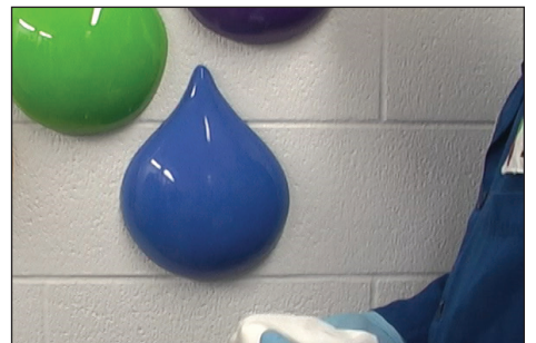
Process is repeated until sign is restored to its original integrity.

Please call Matthews Paint at 1-800-323-6593 if you have questions or if you need sign company references in your area.