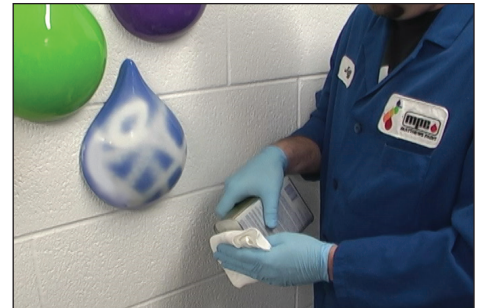
Technician tests mineral spirits on non-conspicuous area.