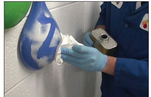
Technician starts at top and wipes downward, removing graffiti.