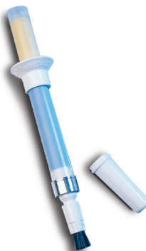
PPG Sempen applicator