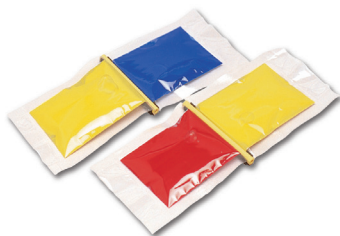
Hinge-paks for 2-part adhesives/encapsulants