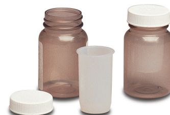
Insert kits for multi-component coatings

Semco is a trademark of PRC-DeSoto International Inc., registered with the U.S. Patent Office.