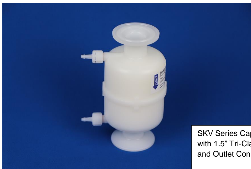
SKV Series Capsule with 1.5" Tri-Clamp Inlet and Outlet Connection

11070 Fleetwood St. Unit B, Sun Valley, CA 91352