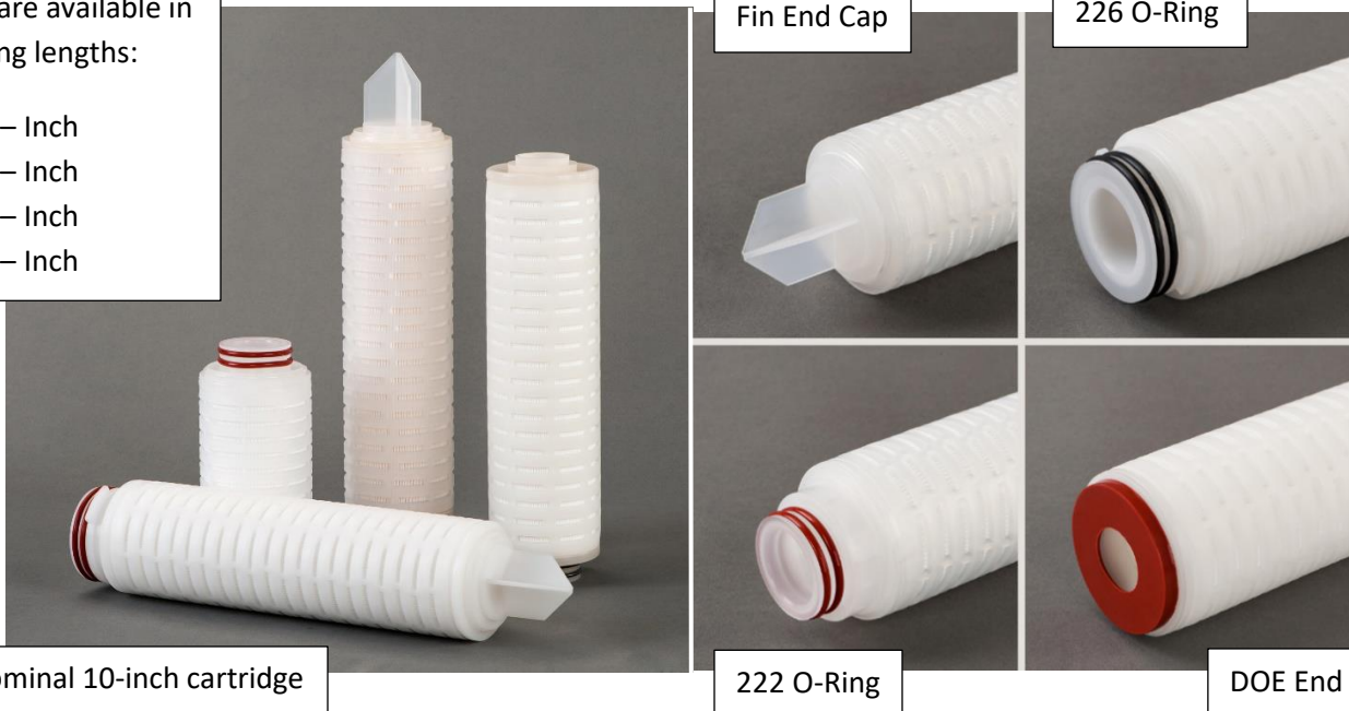
Nominal 10-inch cartridge