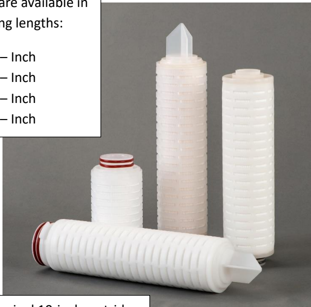
Nominal 10-inch cartridge