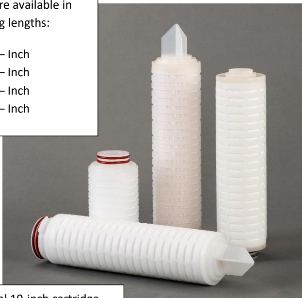
Nominal 10-inch cartridge