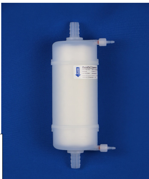
SKV Series Capsule with 1/2" Hose Barb Inlet and Outlet Connection