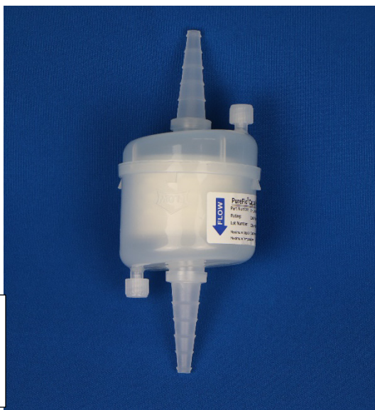
SKL Series Capsule with 1/4"-1/2" Tapered Hose Barb Inlet and Outlet Connection