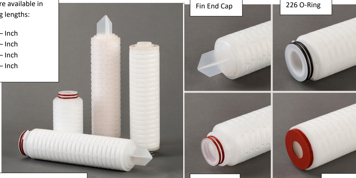
Nominal 10-inch cartridge