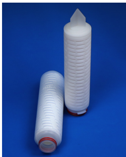
MCS- Series PES Cartridge – 226 O-Rings with Spear End Connection