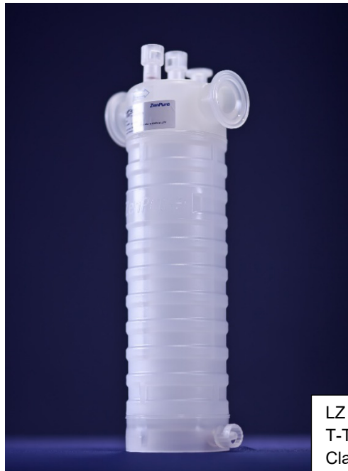
LZ Series [Nominal 10-in Long], T-Type Capsule with 1.5" Tri- Clamp Inlet and Outlet Connection