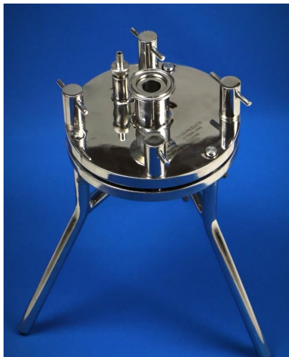
142mm Stainless Steel Disc Holder