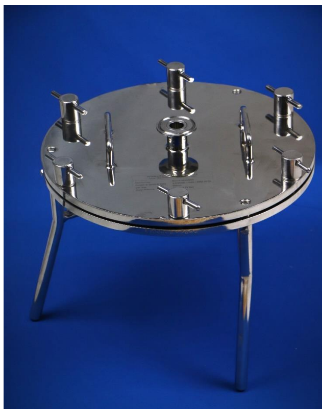
293 mm Stainless Steel Disc Holder

11070 Fleetwood St. Unit B, Sun Valley, CA 91352