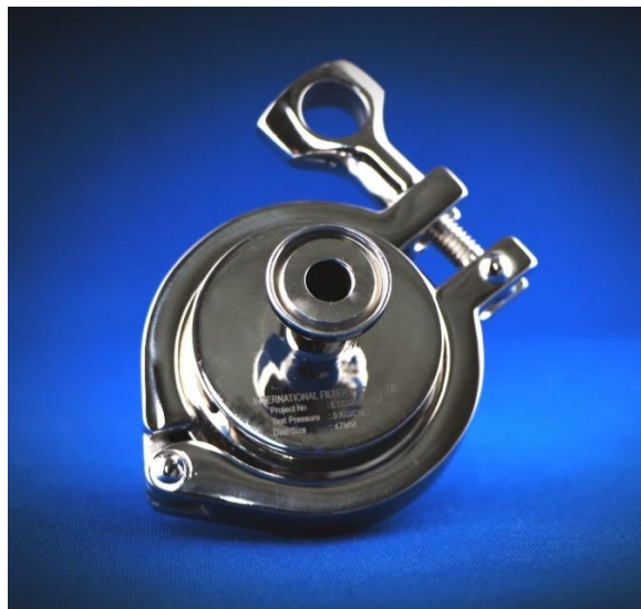
47mm Stainless Steel Disc Holder

Stainless steel disc holders are designed for membrane disc filtration. The disc holders are commonly used in the Chemical, Biological, Pharmaceutical and Food & Beverage industries. The material is 316L stainless steel as ASME BPE standards. The disc holders are portable and easy to assemble. The unique design ensures excellent performance under pressure up to 75 psi [5.2 Bar]. The disc holders are available in different sizes (47mm, 90mm, 142mm and 293mm).