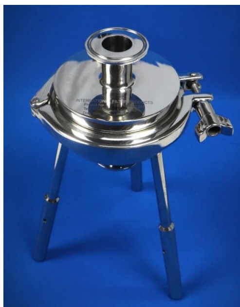
90mm Stainless Steel Disc Holder

11070 Fleetwood St. Unit B, Sun Valley, CA 91352