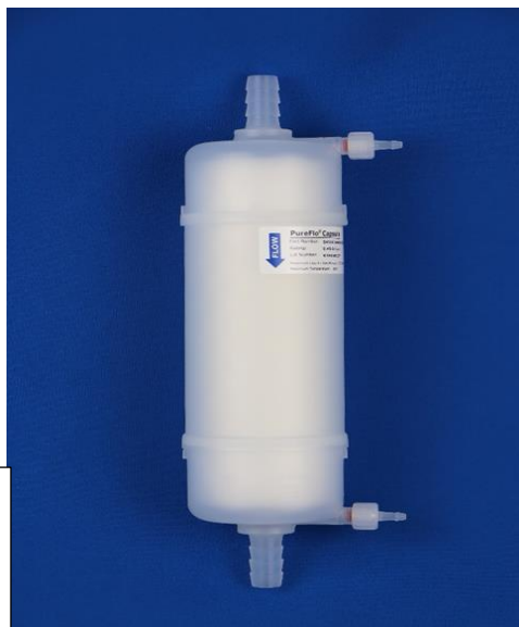
SKV Series Capsule with 1/2" Hose Barb Inlet and Outlet Connection

11070 Fleetwood St. Unit B, Sun Valley, CA 91352