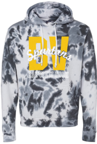
Tie-Dyed Fleece Hooded Sweatshirt J. America 8861 • $$$ UltraColor® Max