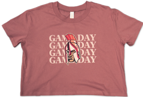
Women's Cotton Jersey Go-To Headliner Crop Tee Alternative 5114C • $ UltraColor® Max