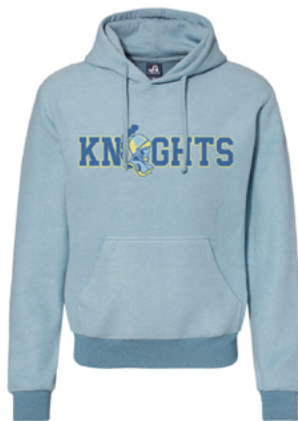
Flip Side Fleece Hooded Sweatshirt J. America 8709 • $$ UltraColor® Max