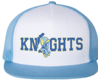
Five Panel Classic Trucker Cap YP Classics 6006 • $ UltraColor® Max