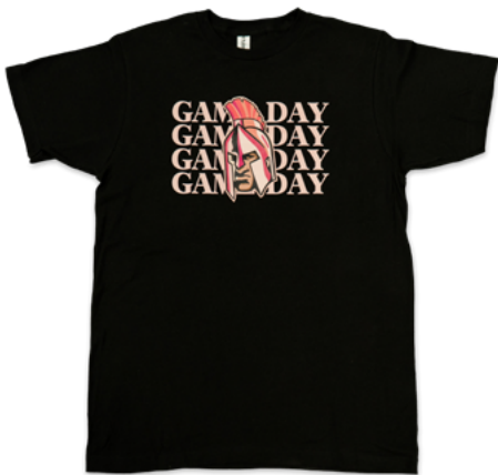
Unisex Heavyweight Jersey T-Shirt Tultex® 5114C • $ UltraColor® Max