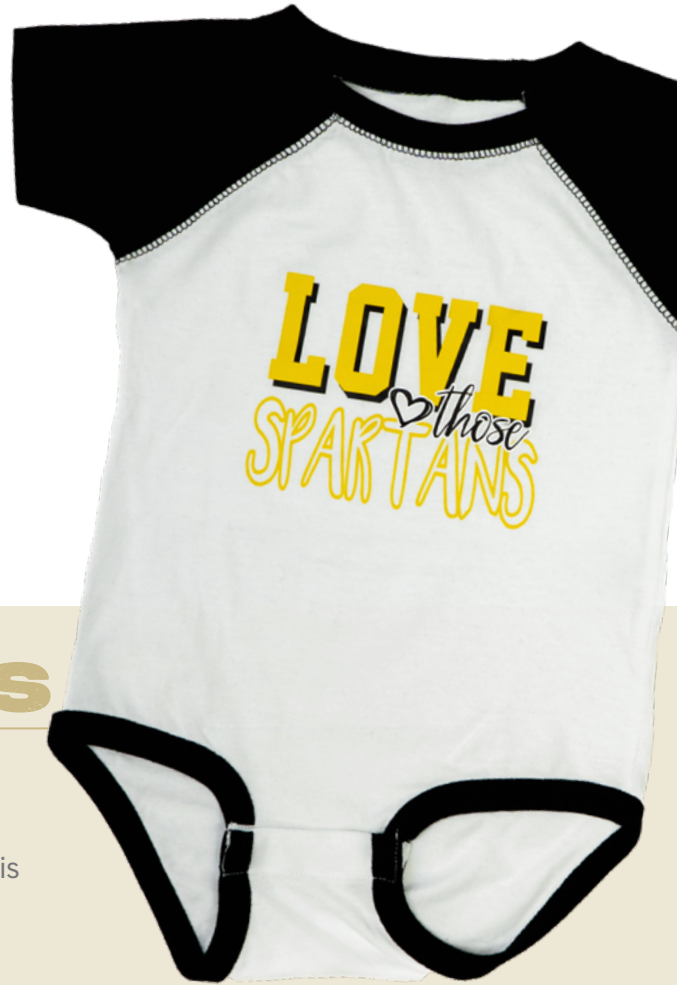
Infant Baseball Fine Jersey Bodysuit Rabbit Skins® 4430 • $ UltraColor® Max