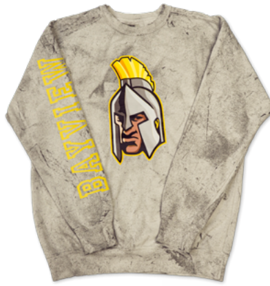
Color Blast Crewneck Sweatshirt

Comfort Colors® 1545 • $$ UltraColor® Max