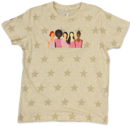
Youth Star Print Tee Code Five 2229 • $ UltraColor® Max