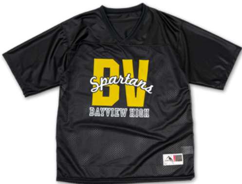
Stadium Replica Football Jersey Augusta Sportswear 257 • $$ UltraColor® Max