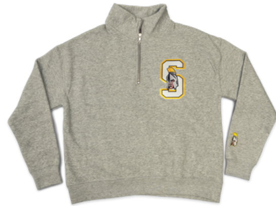
Women's Sueded Fleece Quarter-Zip Sweatshirt

MV Sport W22713 • $$ left chest CAD-PRINTZ® Texture-TWILL® sleeve UltraColor® Max