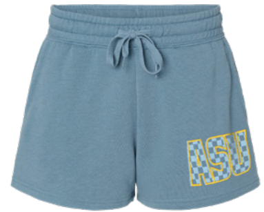
Women's Lightweight California Wave Wash Sheatshorts Independent Trading Co. PRM20SRT • $$ UltraColor® Max