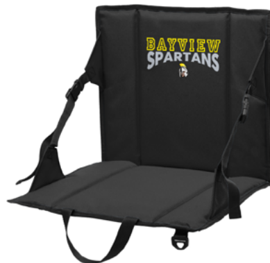
Stadium Seat Port Authority BG601 • $ UltraColor® Max