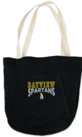
Core Fleece Tote Port & Company BG415 • $ UltraColor® Max