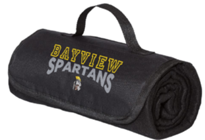
Roll Up Blanket Alpine Fleece 8718 • $ UltraColor® Max