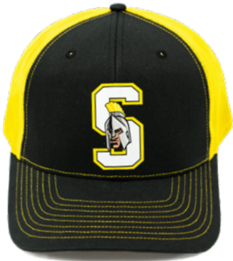
Snapback Trucker Cap Richardson 112 • $ UltraColor® Max

Add popular and profitable custom-printed onesies to your fanwear merchandise this season. Heat printing makes offering unique, personalized items with names and numbers a breeze, helping you stand out from mass-produced alternatives.