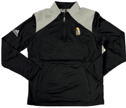
Textured Mixed Media Quarter-Zip Pullover