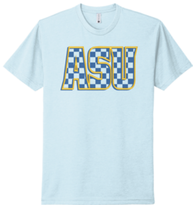
Unisex CVC T-Shirt Next Level 6210 • $ UltraColor® Max