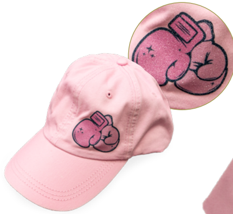
Pigment-Dyed Cap Sportsman SP500 • $ CAD-PRINTZ® Glitter Flake™