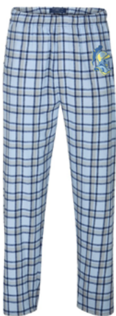
Harley Flannel Pants Boxercraft BM6624 • $$ UltraColor® Max