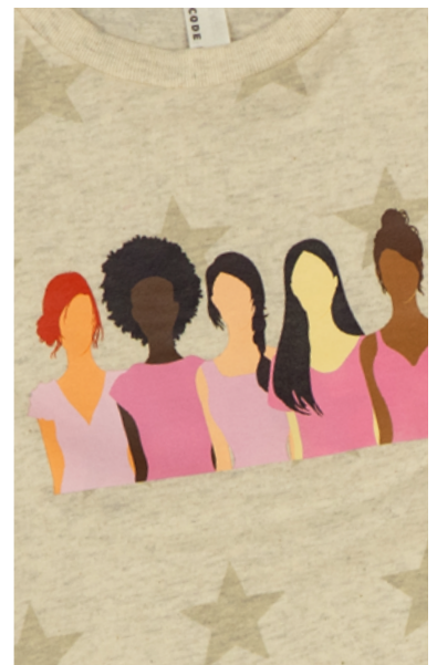
Unisex Fine Jersey T-Shirt Tultex ® 202 • $ UltraColor ® Max

When it comes to large quantity orders, screen printed transfers are an economical and efficient decoration option, seamlessly complementing apparel styles customers will love!