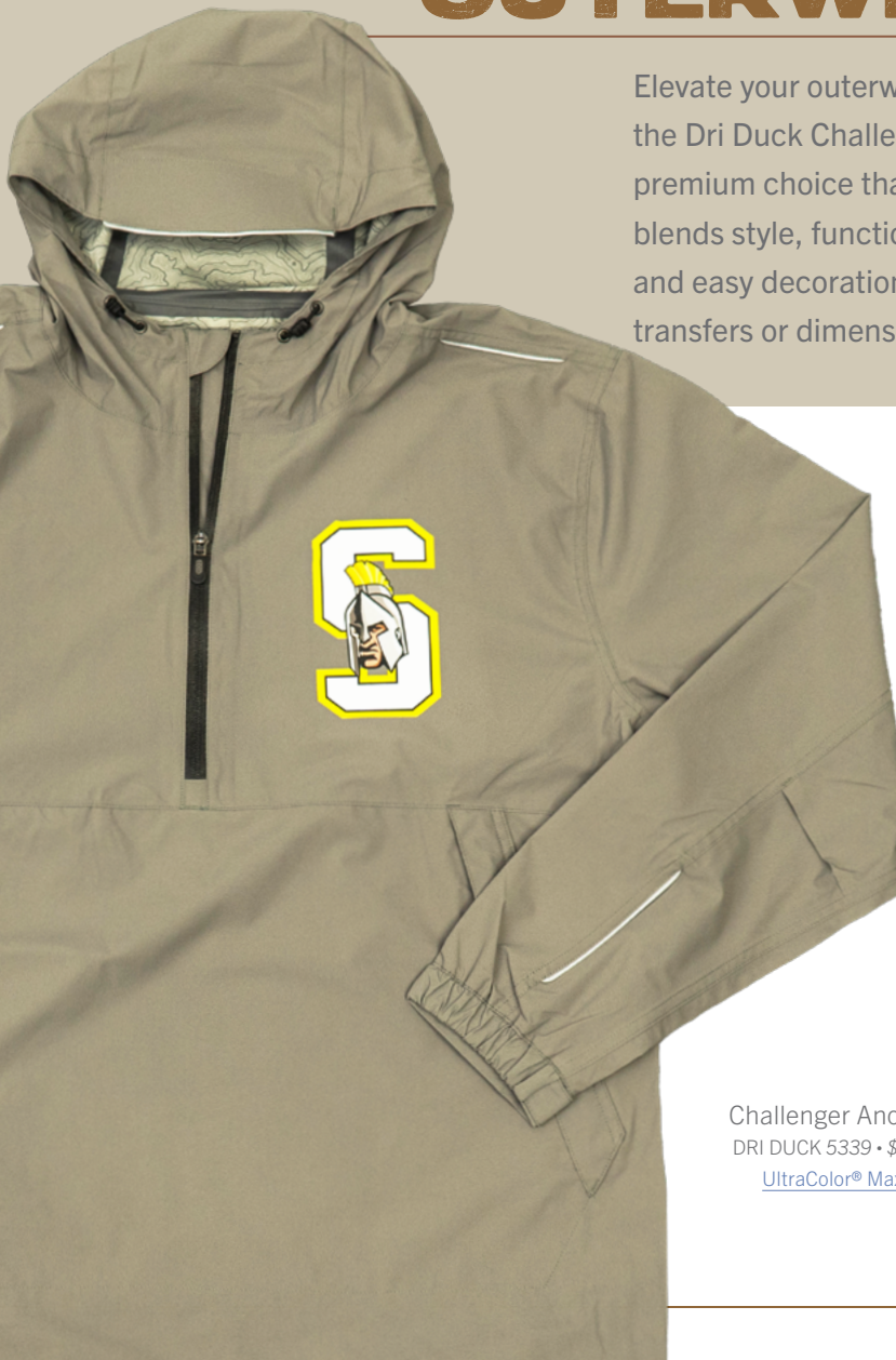
Challenger Anorak DRI DUCK 5339 • $$$$ UltraColor® Max

Elevate your outerwear game with the Dri Duck Challenger Anorak, a premium choice that effortlessly blends style, functionality, and easy decoration with DTF transfers or dimensional logos.