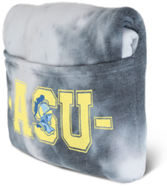
Triblend Fleece Blanket J. America 8852 • $$$ UltraColor® Max