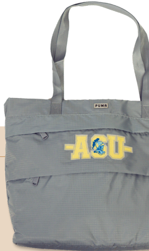
Fashion Tote PUMA® PSC1054 • $ CAD-PRINTZ® Glitter Flake

Tote bags have become the accessory of choice for many students. This trendy Puma tote is the perfect reusable bag that can be easily custom printed with your heat press. Diversifying your print finishes with unique heat transfers, such as full-color glitter HTV, will help cater to different tastes and preferences of students that want to rep their school.