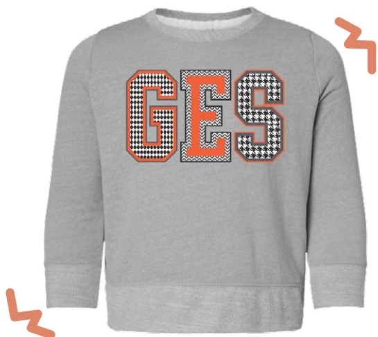
French Terry Long Sleeve 2279 LAT Apparel

Decoration methods that include a sensory element, such as flock HTV or a Flexstyle® patch, bring an extra layer of fun for students.