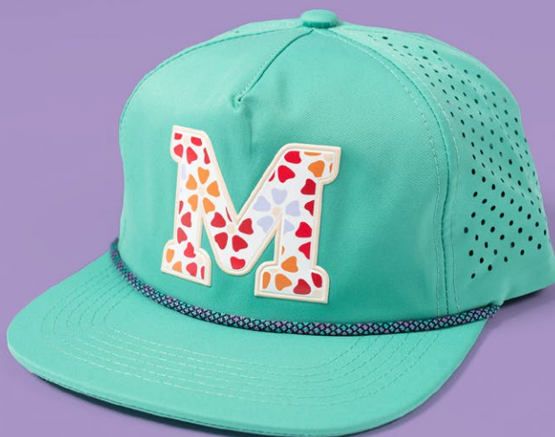
The Bogey Performance Hat C975 Crafted MFG Flexstyle® Beveled