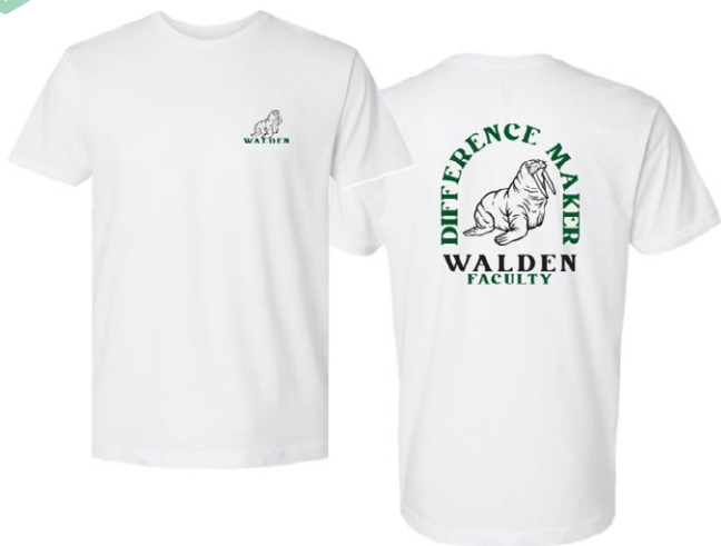
Fine Jersey Tee 6901 LAT Apparel UltraColor Max™