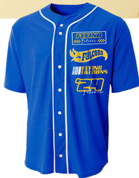
Full Button Baseball Top N4184 A4

Shake up the paradigm and mix in two different styles, like this baseball button down and these racing style decorations. A combination of CAD-PRINTZ® Perma-Twill® and UltraColor Max™ in variations of the school mascot is a quick way to bring the spirit of the school back into the apparel with a premium retail look and feel.