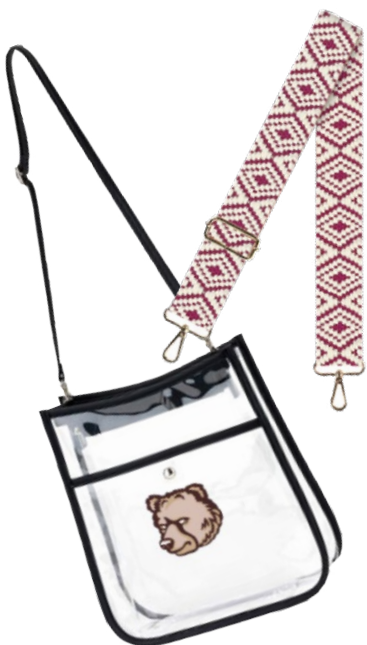
Black Clear Heather Purse M709VL-CLRBLK Viv&Lou