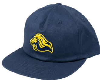
Roam Strapback blvnk.