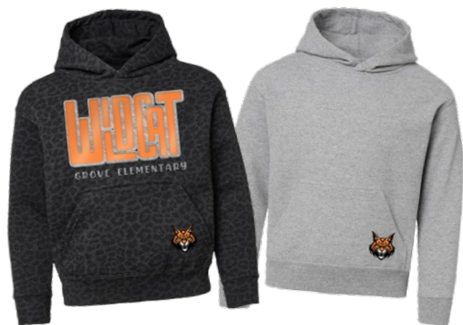
Fleece Hoodie 2296 LAT Apparel