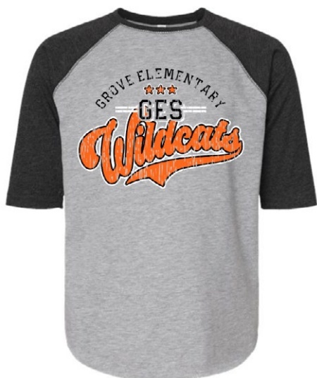
Baseball Sleeve Tee 6130 LAT Apparel UltraColor Max™