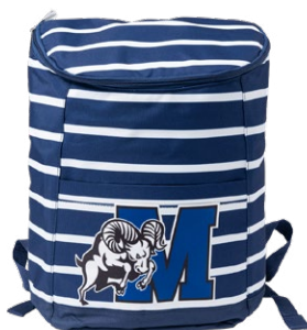
Navy Stripe Cooler Backpack M675VL-STNAVY Viv&Lou

Changing up the straps on this Viv&Lou bag not only adds personality but also provides an additional spot for decoration— a perfect place for another patch or emblem.