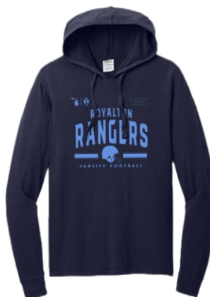
Fan Favorite Hooded Sweatshirt PC850H Port & Company