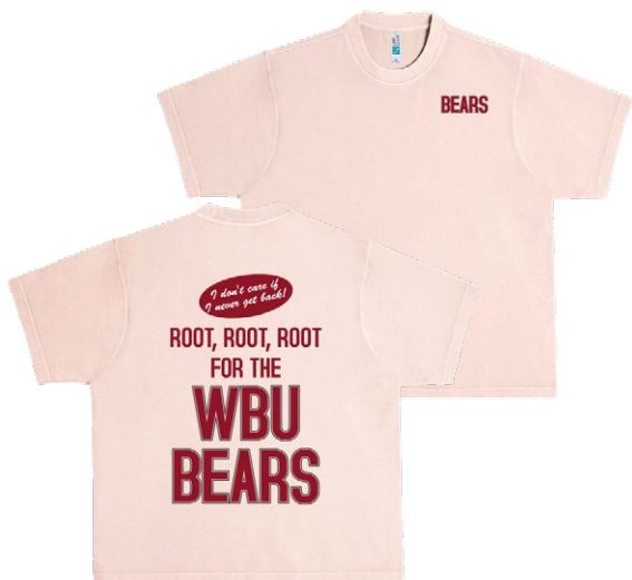
Heavyweight T-Shirt LSI6005 Lane Seven Goof Proof® (Distressed)