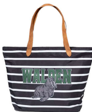
Stripe Tote M756VL-STBLK Viv&Lou