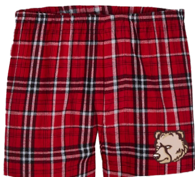
Flannel Short BM670I Boxercraft Print Stitch