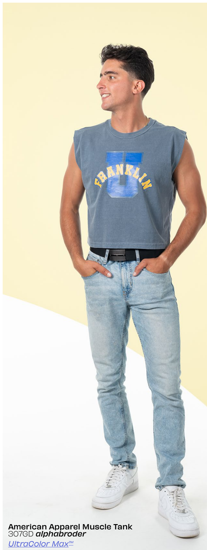
American Apparel Muscle Tank 307GD alphabroder UltraColor Max™