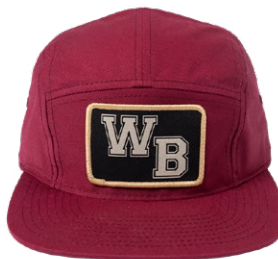
Avenue 5 Panel blvnk.

Flexstyle® Beveled CAD-PRINTZ® Chroma-TWILL™