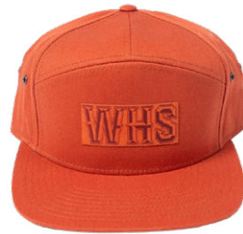
Lucky #7 Panel blvnk.