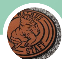
Faux Leather Patch