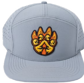
The Siete Pro 7P C975 Crafted MFG 3D Embroidered Patch