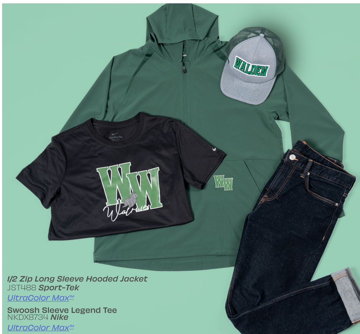
1/2 Zip Long Sleeve Hooded Jacket JST488 Sport-Tek UltraColor Max™