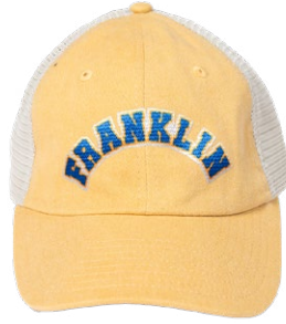
Pigment-Dyed Trucker Cap SP510 Sportsman Cap CAD-PRINTZ® Perma-Twill®