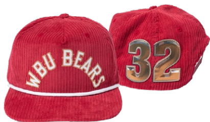
Gramps Corduroy Snapback blvnk.

Flexstyle® Beveled CAD-PRINTZ® Chroma-TWILL™