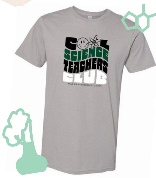
Heritage Jersey Tee T425 Champion UltraColor Max™