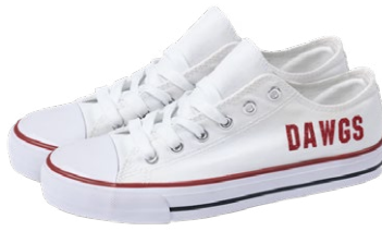
Canvas Sneaker B07D8NRTXC Amazon CAD-CUT® Glitter Flake™