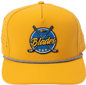
The Bogey Performance Hat C975 Crafted MFG Embroidered Patch