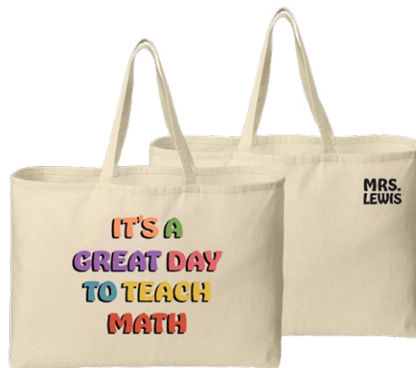
Ideal Twill Jumbo B300 Port Authority UltraColor Max™