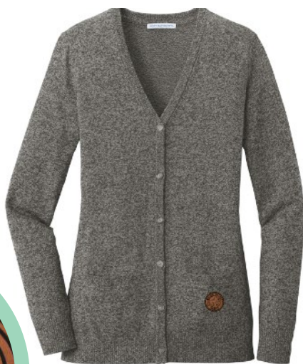
Marled Cardigan Sweater LSW415 Port Authority Faux Leather Patch