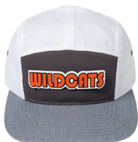
Avenue 5 Panel blvnk.