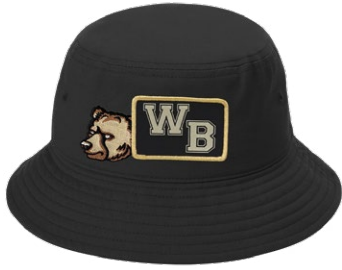
Classic Bucket Hat C975 Port Authority Woven Patch Print Stitch Patch