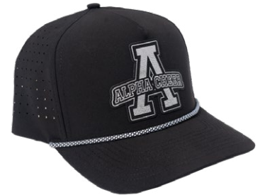
The Bogey Performance Hat C975 Crafted MFG Faux Leather