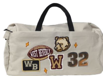
Claremont Duffie MMB810 Mercer+Mettle