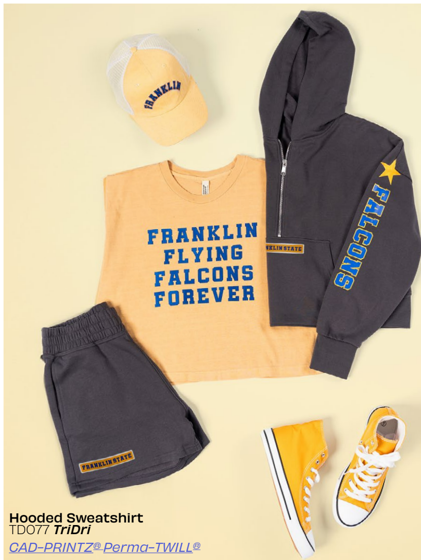
Hooded Sweatshirt TD077 TriDri CAD-PRINTZ® Perma-TWILL®