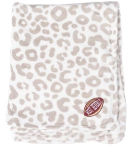
Natural Leopard Blanket M280VI-NATLPRD Viv&Lou Embroidered Patch