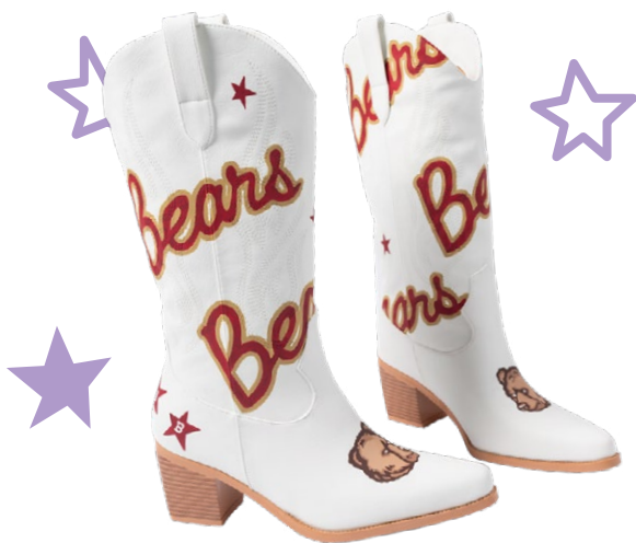
White Cowgirl boots BOD6VNTWIJ Amazon

Port Authority Stadium Seat BG60I SanMar UltraColor Max™