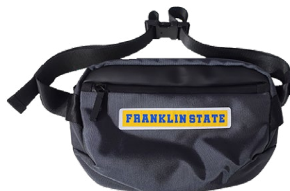
Crossbody Pack MMB600 Mercer+Mettle