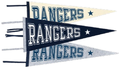
Blank Pennant Flag C975 Liberty Pennant Goof Proof®