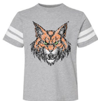
Football Tee 6137 LAT Apparel UltraColor Max™