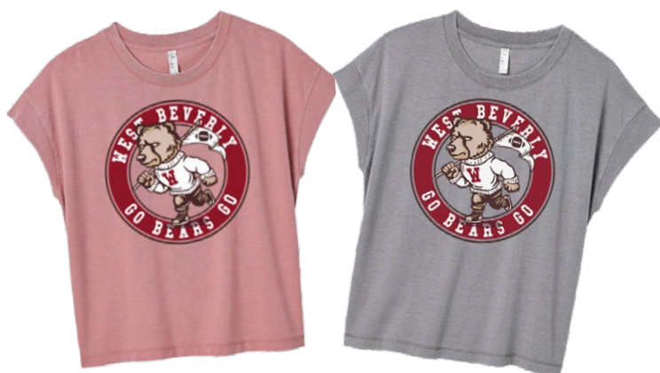
Relaxed Vintage Wash T-Shirt 3502LA LAT Apparel UltraColor Max™

College is hard but your clothes don't have to be. Dorm-room style is making its way out of bed and into the classrooms! Soft fabrics, loose fits, and light decoration methods.