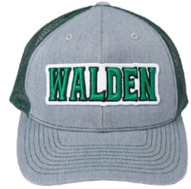
Snapback Trucker Cap 112 Richardson 3D Embroidered Patch