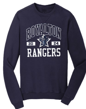
Beach Wash Crewneck PC908 Port & Company