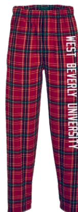
Harley Flannel Pant BM6701 Boxercraft CAD-CUT® Puff