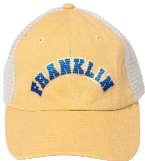
Pigment-Dyed Trucker Cap SP510 Sportsman Cap CAD-PRINTZ® Perma-Twill®

Expand your product offerings and attract younger audiences with trendy styles, crops, and boxy fits mixed with traditional decoration methods.