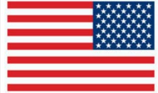
USA - reversed (perfect for right sleeve)