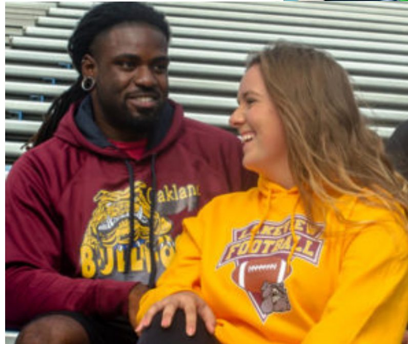
Layouts MAS-60 QFB-104