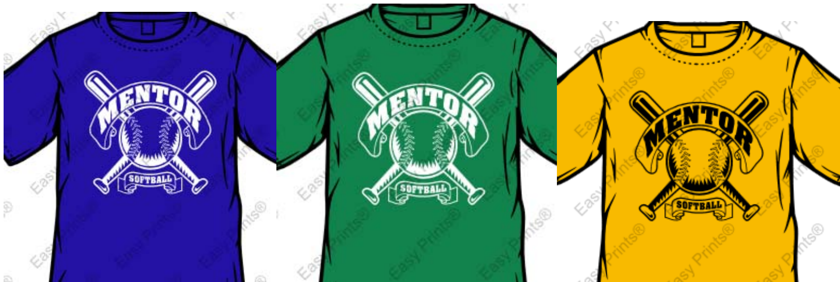
QBA-243 with color change