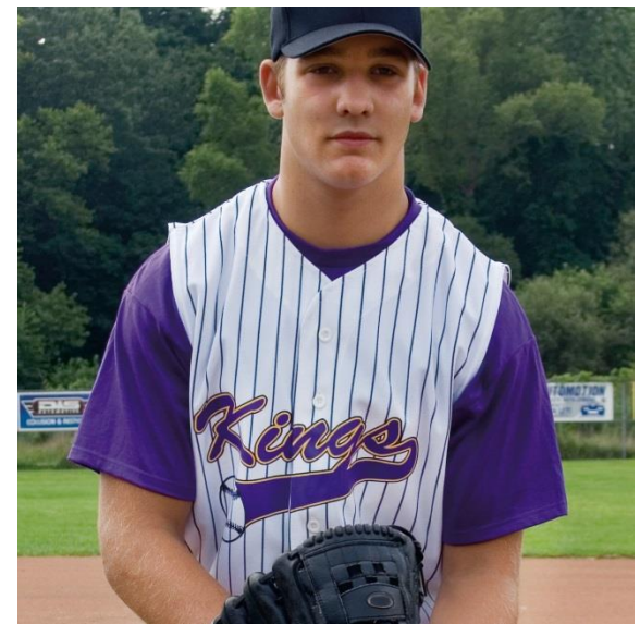
Full Button Uniform $15-$20