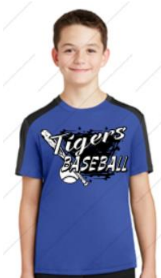
Performance T $7