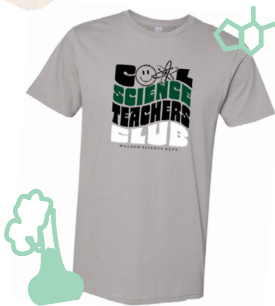
Heritage Jersey Tee T425 Champion UltraColor Max™