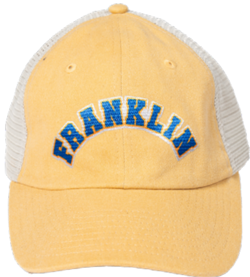
Pigment-Dyed Trucker Cap SP510 Sportsman Cap CAD-PRINTZ® Perma-Twill®

Expand your product offerings and attract younger audiences with trendy styles, crops, and boxy fits mixed with traditional decoration methods.