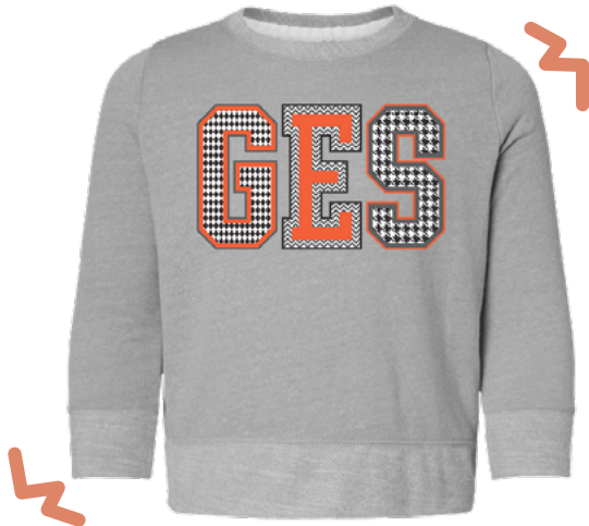
French Terry Long Sleeve 2279 LAT Apparel

Decoration methods that include a sensory element, such as flock HTV or a Flexstyle® patch, bring an extra layer of fun for students.