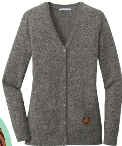
Marled Cardigan Sweater LSW415 Port Authority Faux Leather Patch