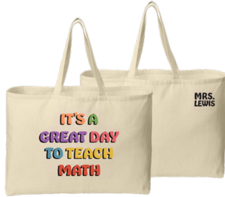
Ideal Twill Jumbo B300 Port Authority UltraColor Max™