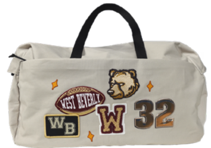
Claremont Duffel MMB810 Mercer+Mettle Various Patches Faux Suede Patches