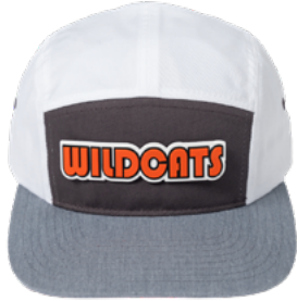
Avenue 5 Panel blvnk. PVC Patch