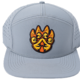
The Siete Pro 7P C975 Crafted MFG 3D Embroidered Patch