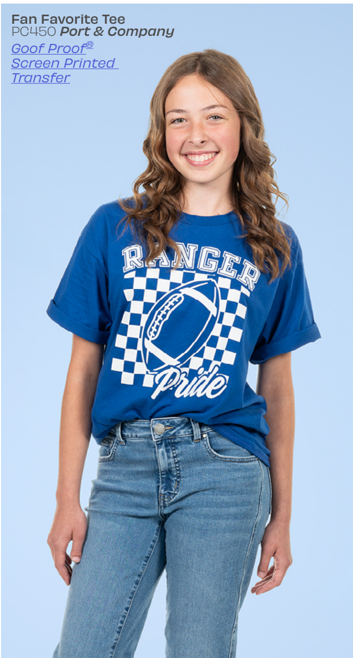
Fan Favorite Tee PC450 Port & Company Goof Proof® Screen Printed Transfer

Keep diversity high and cost low with screen printed color changes. Increase order quantity to hit those price breaks with a lower per piece print cost for more profit.