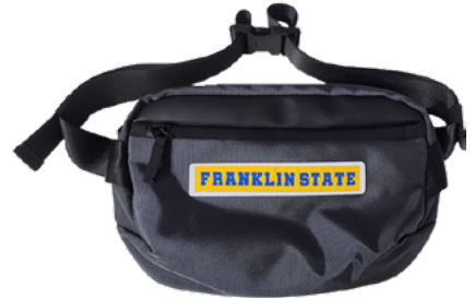
Crossbody Pack MMB600 Mercer+Mettle Woven Patch