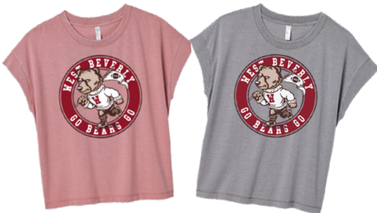
Relaxed Vintage Wash T-Shirt 3502LA LAT Apparel UltraColor Max™

College is hard but your clothes don't have to be. Dorm-room style is making its way out of bed and into the classrooms! Soft fabrics, loose fits, and light decoration methods.