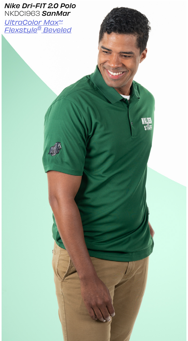
Nike Dri-FIT 2.0 Polo NKDCI963 SanMar UltraColor Max™ Flexstyle® Beveled