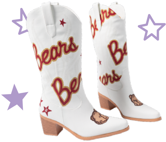
White Cowgirl boots BOD6VNTWIJ Amazon