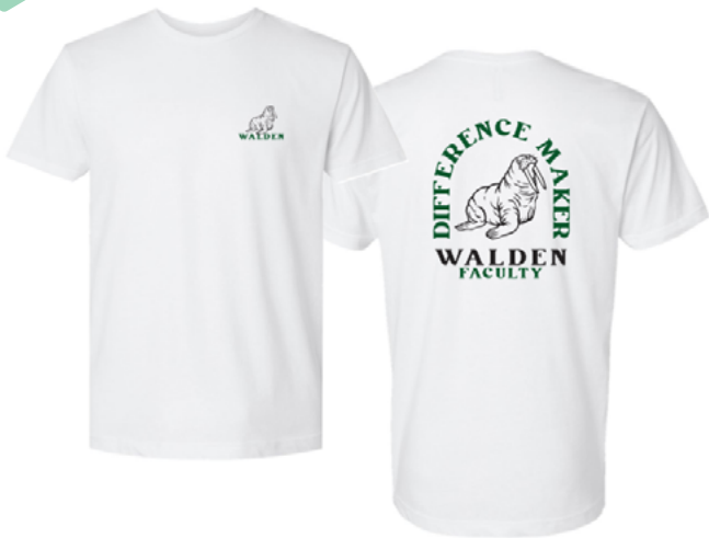
Fine Jersey Tee 6901 LAT Apparel UltraColor Max™