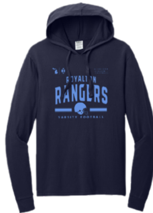
Fan Favorite Hooded Sweatshirt PC850H Port & Company Goof Proof® Screen Printed Transfer