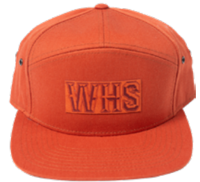
Lucky #7 Panel blvnk. Faux Suede Patches