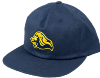
Roam Strapback blvnk. 3D Embroidered Patch