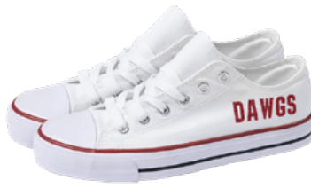
Canvas Sneaker B07D8NRTXC Amazon CAD-CUT® Glitter Flake™