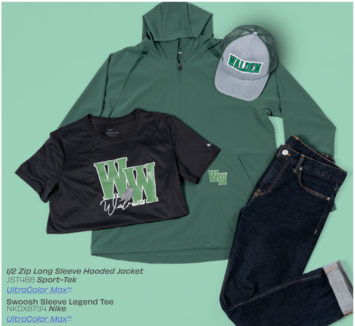
1/2 Zip Long Sleeve Hooded Jacket JST488 Sport-Tek UltraColor Max™