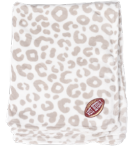
Natural Leopard Blanket M280VI-NATLPRD Viv&Lou Embroidered Patch