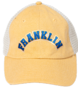
Pigment-Dyed Trucker Cap SP510 Sportsman Cap CAD-PRINTZ®-Perma-Twill®