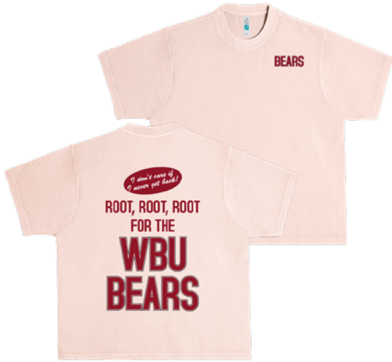
Heavyweight T-Shirt LSI6005 Lane Seven Goof Proof® (Distressed)