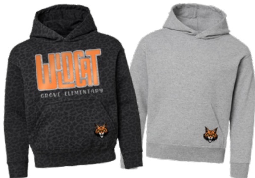
Fleece Hoodie 2296 LAT Apparel