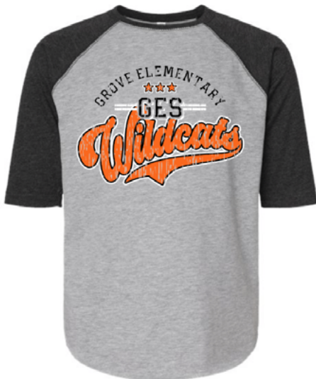
Baseball Sleeve Tee 6130 LAT Apparel UltraColor Max™