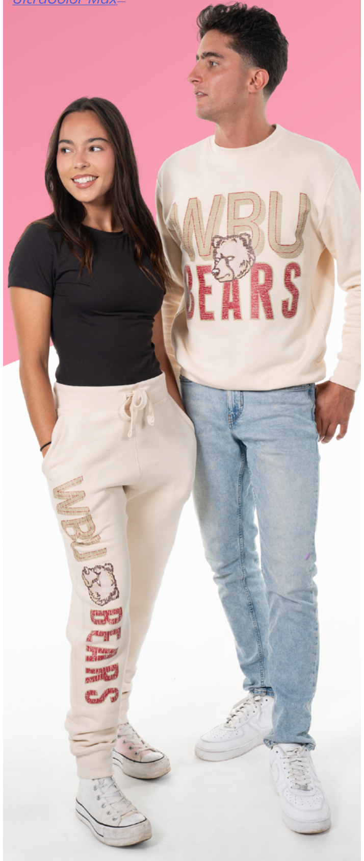
Premium Crewneck Sweatshirt LSI4004 Lane Seven UltraColor Max™