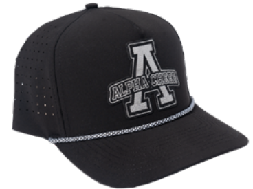
The Bogey Performance Hat C975 Crafted MFG Faux Leather