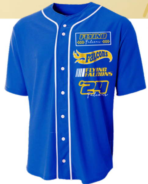
Full Button Baseball Top N4184 A4

Shake up the paradigm and mix in two different styles, like this baseball button down and these racing style decorations. A combination of CAD-PRINTZ® Perma-Twill® and UltraColor Max™ in variations of the school mascot is a quick way to bring the spirit of the school back into the apparel with a premium retail look and feel.