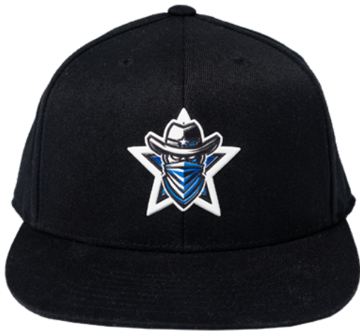
Flexfit 110 Outdoor Cap C937 Port Authority Flexstyle® Beveled

Elevate your basics with multiple print locations. Pairing Flexstyle® dimensional decorations (also used on headwear) with an UltraColor Max™ direct-to-film print on the sleeve builds value and is easy to decorate, even on heat-sensitive fabrics.