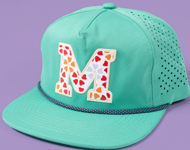
The Bogey Performance Hat C975 Crafted MFG Flexstyle® Beveled