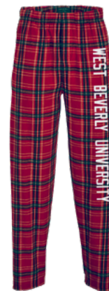
Harley Flannel Pant BM6701 Boxercraft CAD-CUT® Puff