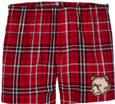
Flannel Short BM670I Boxercraft Print Stitch