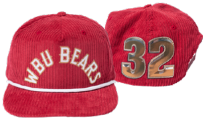
Gramps Corduroy Snapback blvnk. Flexstyle® Beveled CAD-PRINTZ® Chroma-TWILL™