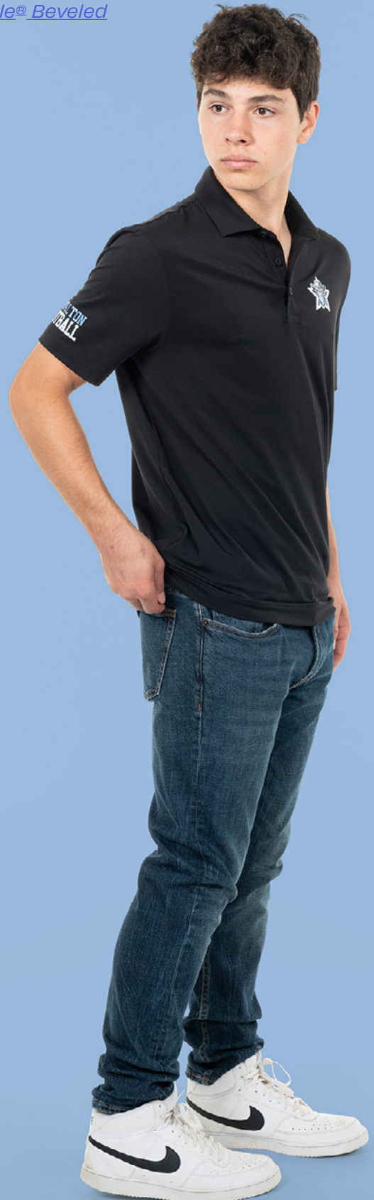
Fine Jersey Polo MM1014 Mercer & Mettle UltraColor Max™ Flexstyle® Beveled