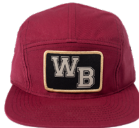
Avenue 5 Panel blvnk. Woven Patch