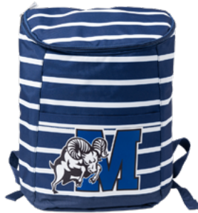
Navy Stripe Cooler Backpack M675VL-STNAVY Viv&Lou CAD-PRINTZ® Chroma-TWILL™

Changing up the straps on this Viv&Lou bag not only adds personality but also provides an additional spot for decoration— a perfect place for another patch or emblem.