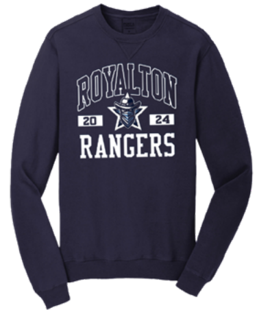
Beach Wash Crewneck PC908 Port & Company UltraColor Max™