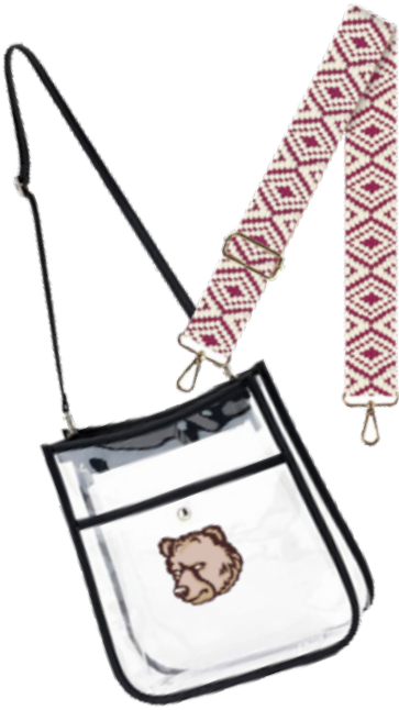
Black Clear Heather Purse M709VL-CLRBLK Viv&Lou CAD-PRINTZ® Chroma-TWILL™