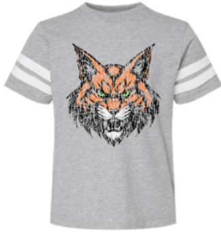
Football Tee 6137 LAT Apparel UltraColor Max™