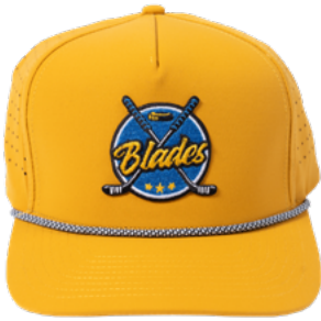
The Bogey Performance Hat C975 Crafted MFG Embroidered Patch