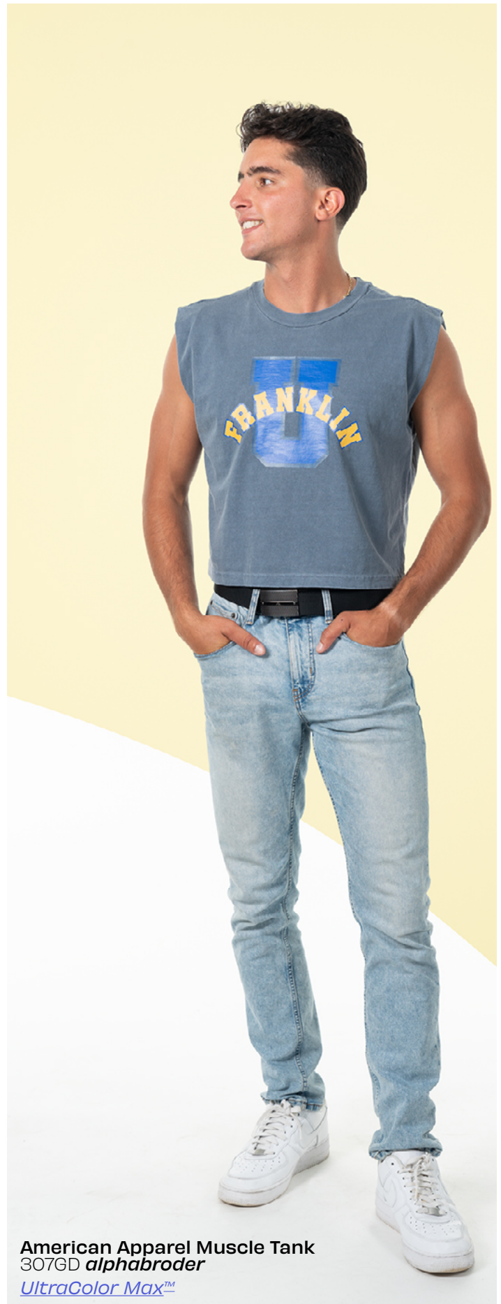
American Apparel Muscle Tank 307GD alphabroder UltraColor Max™