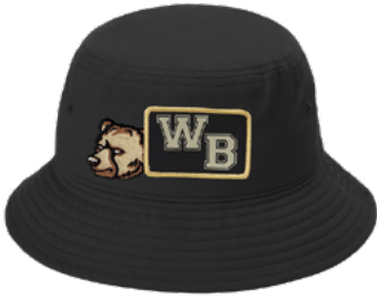
Classic Bucket Hat C975 Port Authority Woven Patch Print Stitch Patch