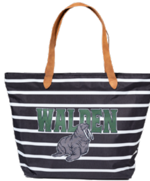
Stripe Tote M756VL-STBLK Viv&Lou CAD-PRINTZ® Chroma-TWILL™