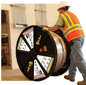
SIMpull™ Reel in transit