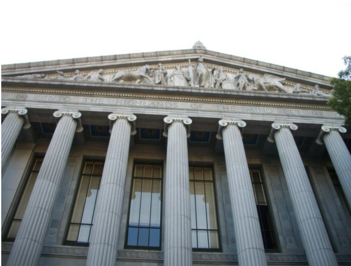
The State of California Third District Court of Appeals Sacramento Courthouse