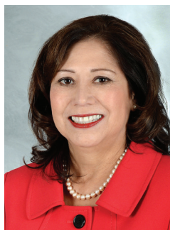
Hilda L. Solis Chair, Pro Tem Supervisor, First District

These directives are part of a comprehensive countywide effort, inclusive of partnerships with the community, businesses, and nonprofits, to identify actionable ideas to spur economic recovery.