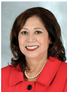
Hilda L. Solis Chair Pro Tem Supervisor, First District

These directives are part of a comprehensive countywide effort, inclusive of partnerships with the community, businesses, and nonprofits, to identify actionable ideas to spur economic recovery.