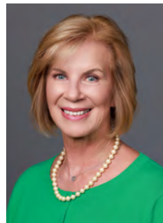
Janice Hahn Supervisor, Fourth District