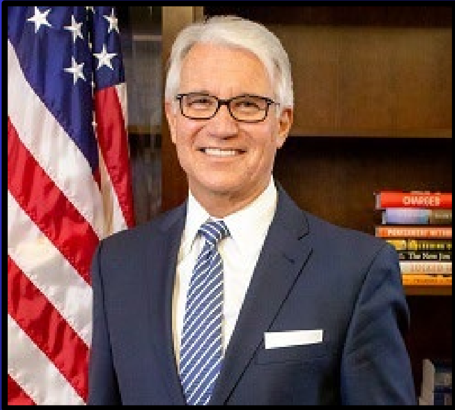
GEORGE GASCÓN DISTRICT ATTORNEY Elected November 3, 2020